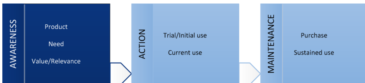
Figure 2. Behavior Change Continuum